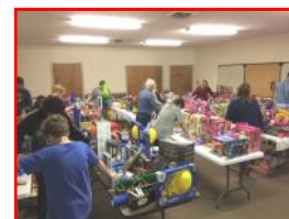
Volunteers Setting Up and Praying