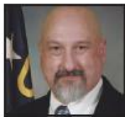
Sheriff Charlie McDonald

What if disaster were to strike our community? What if a calamity were to cause people from nearby cities to migrate to the mountains of Western North Carolina for refuge? Would we be prepared to serve them well? Are we personally ready?